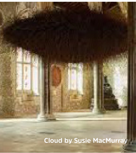
Cloud by Susie MacMurray